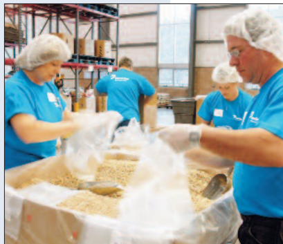
Company volunteers help repack cereal provided to a food bank by the Dominion Foundation.

If you are interested in Project Plant It! , please visit www.projectplantit.com .